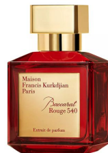
Baccarat Rouge 540