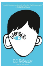
Wonder by R.J. Palacio

Wonder for school-aged kids and Giraffes Can't Dance for the toddler set.