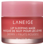
LANEIGE Lip Sleeping Mask, $24

Magnesium, my Kindle, and LANEIGE lip treatment