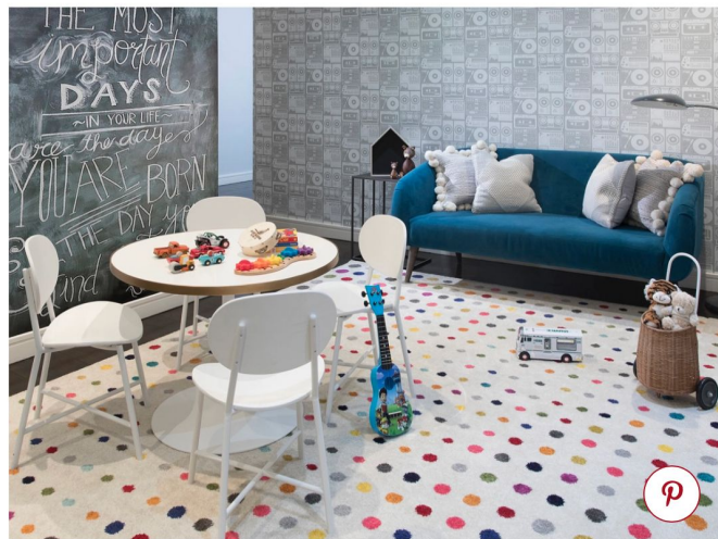
Children's playroom designed by Purvi Padia. Courtesy of Purvi Padia.

by KENZIE MASTROE FEBRUARY 28, 2023 AT 8:55AM AM EST