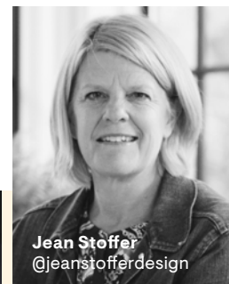
Jean Stoffer @jeanstofferdesign

Purvi: Well, rooms are being used multifunctionally now.