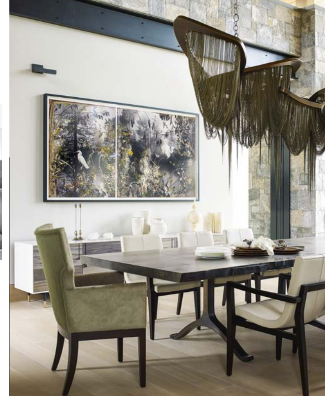
A DINING ROOM BY PURVI PADIA CAN ALSO SERVE AS AN OFFICE WITH SIDEBOARD STORAGE AND ARTWORK AS A ZOOM BACKGROUND.

and they realize, I should go ahead and work on this closet, or redo this pantry.