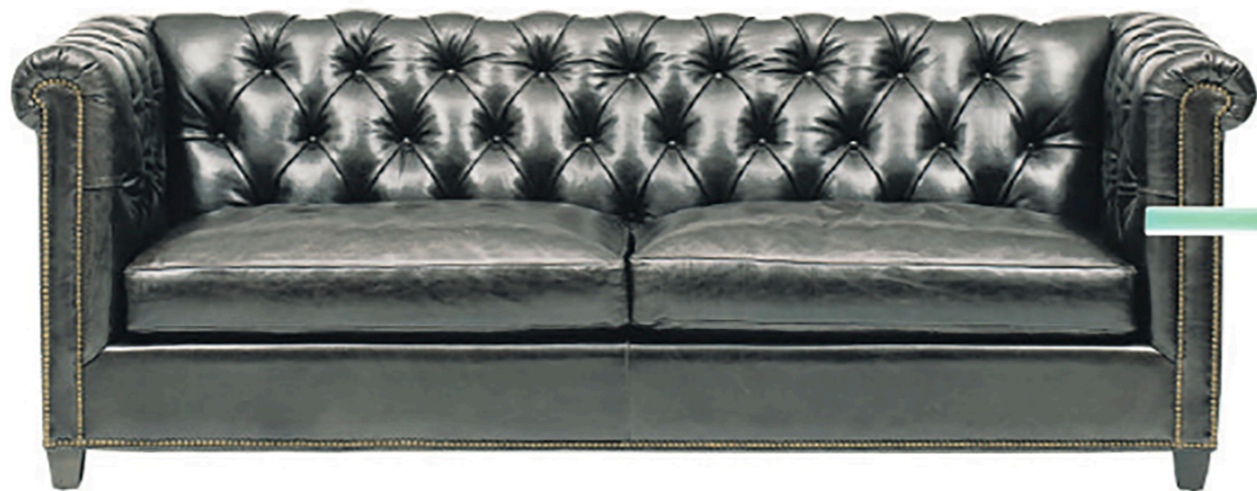
William Leather Sofa, $3,299, highfashionhome.com

► Would you like to offer a design solution? Go to wsj.com and share one in the comments.