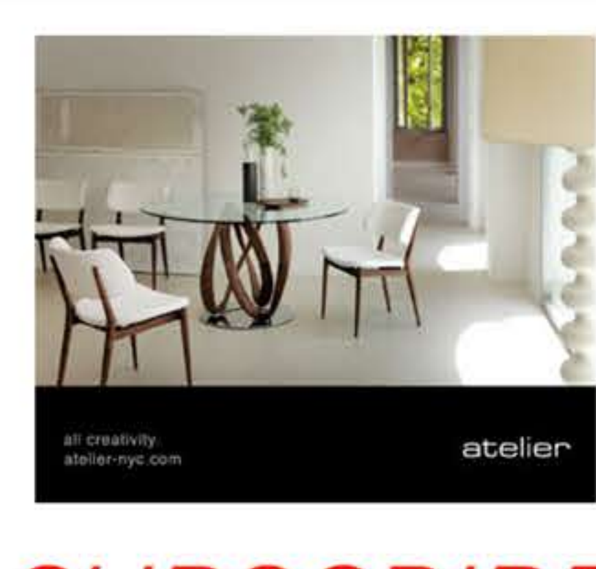
all creativity atelier-nyc.com atelier