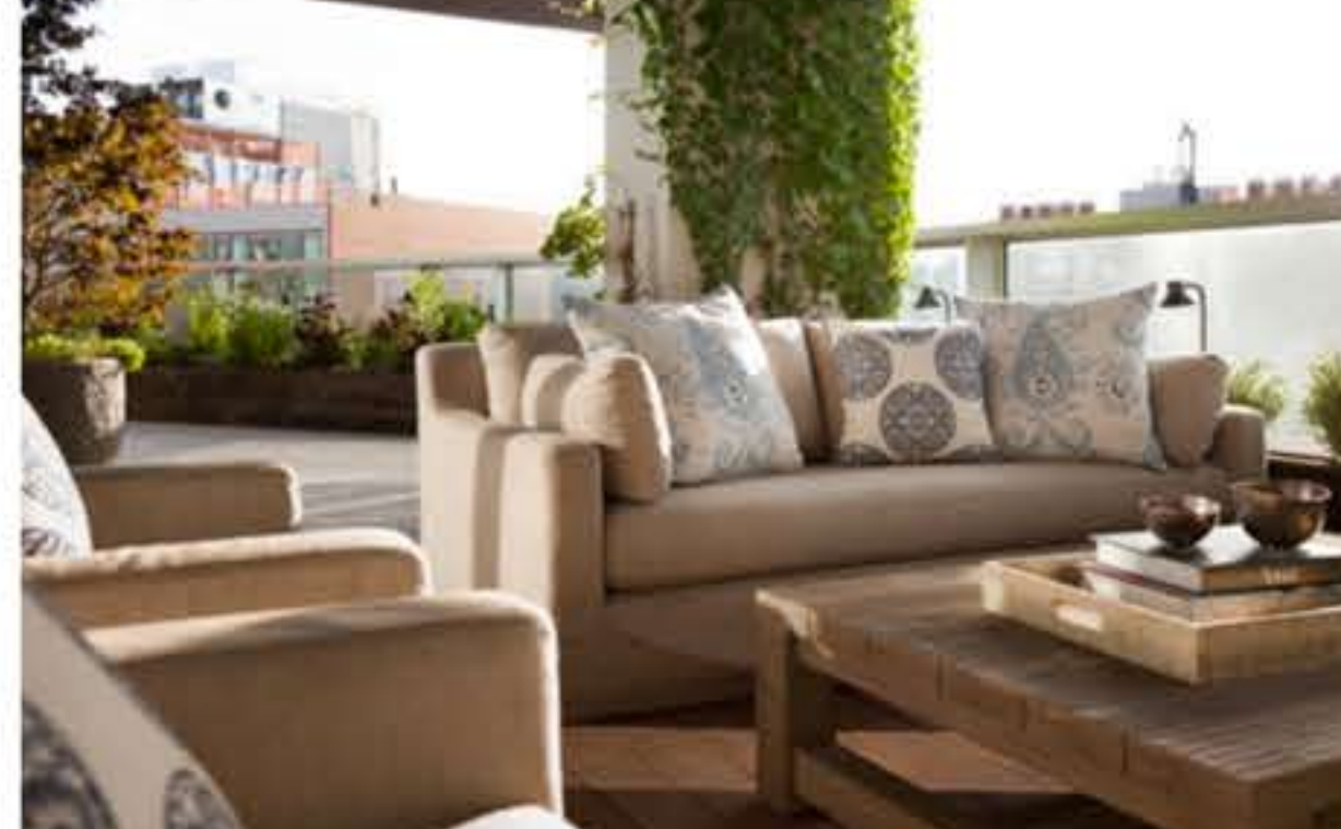
Design by Purvi Padia.

Purvi Padia: My style relies heavily on neutrals and layering textures to add interest, depth and a sense of luxury. A basic sofa can be transformed into something much more sophisticated with a fur throw and cowhide pillows. Layering enables you to add luxe materials without overdoing it and creates a sense of comfort and coziness.